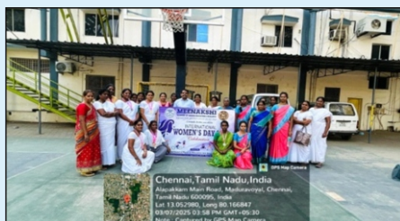
Women staffs and students participating during women's day celebration at Meenakshi Ammal Dental College