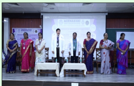
Inauguration of CME program on Menopausal Health

Department of Community Medicine at Meenakshi Medical College Hospital & Research Institute (MMCH&RI) conducted the 5 th International Online CME event, CERVICON 2025, from February 4 th to 6 th , 2025. The event was organized to commemorate World Cancer Day 2025, with a primary focus on Cervical Cancer Elimination by 2030 through HPV vaccination and screening programs.