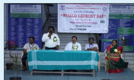
Dignitaries taking oath on World Leprosy Day