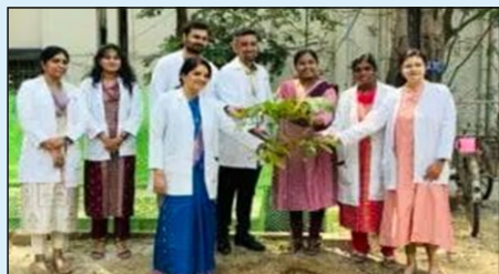
Students planting samplings