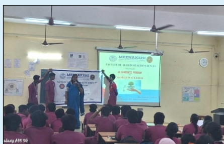
Students presenting their posters

In commemoration of World Water Day, two vibrant events were organized by constituent units of MAHER, aimed at raising awareness about the importance of water conservation and sustainable practices. On 22 nd March, 2025, the National Service Scheme (NSS) of the Faculty of Allied Health Sciences, MAHER, organized a drawing competition. Students participated enthusiastically, using their artistic talents to creatively highlight the significance of water conservation and the urgent need to protect this vital resource.