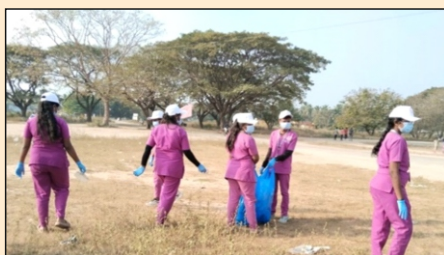
NSS volunteers collecting plastic waste from Pachaiyappa's Men's College

NSS volunteers of the Faculty of Allied Health Sciences, MAHER, actively participated in a mass beach cleanup initiative at Marina Beach on 22 nd February, 2025. A dedicated group of 15 students took part in this environmental awareness campaign, working collaboratively to remove litter and waste, thereby contributing to the preservation of the coastal ecosystem and promoting environmental responsibility.