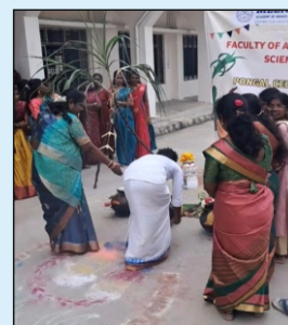
Staffs and students celebrating pongal