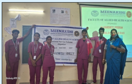
World water day celebration