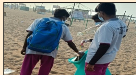
NSS volunteers participating in mass beach cleanup initiative at Marina Beach