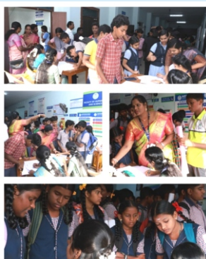
School students participating enthusiastically in the competitions