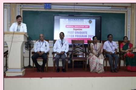
Inauguration of the program

The program concluded with a feedback session, a post-test to evaluate learning outcomes, and a valedictory ceremony marking the successful completion of the induction program.