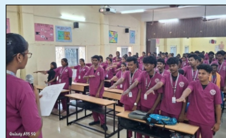
Students taking their oath