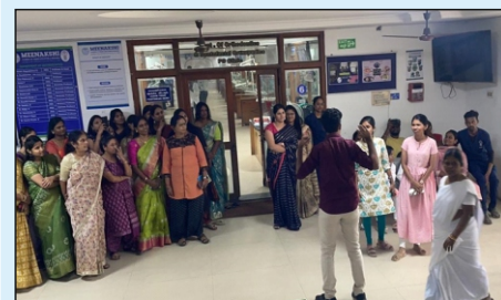
Interns acting out the awareness skit