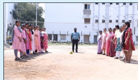
Women faculty participating in sports

To commemorate International Women's Day 2025, various constituent institutions of Meenakshi Academy of Higher Education and Research (MAHER) organized a vibrant array of programs celebrating the strength, achievements, and empowerment of women. The celebrations commenced on 7 th March, 2025, with a Walkathon and Sports Meet organized by the Sports & Games Committee at Meenakshi Medical College Hospital and Research Institute (MMCH&RI). Participants dressed in pink and purple as a symbol of empowerment, beginning the walkathon from the Pre-Clinical Block. This was followed by spirited sports competitions including Throwball, Shot Put, and a 30-meter run, with winners receiving certificates. The event fostered camaraderie, fitness, and appreciation for the contributions of women faculty and staff.