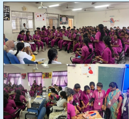
Students participating in various competitions