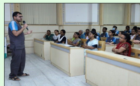
Inauguration of the program