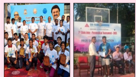
Achievers of Hackathon