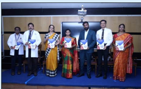
Release of Meenakshi Healthcare Benefit Schemes