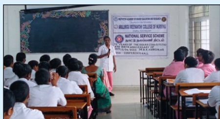
Student participating in the elocution competition