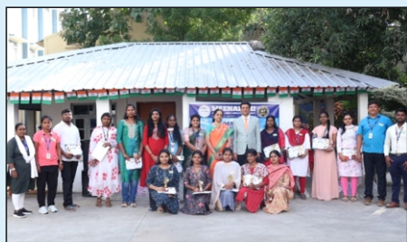
Winners were awarded with prizes by Vice Chancellor and Pro Vice Chancellor