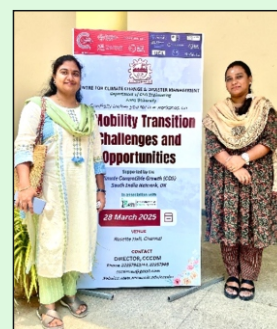
Representatives of MAHER at the conclave