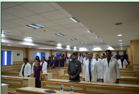
Audience at the session