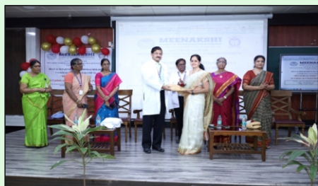
Winners receiving prizes during valedictory function