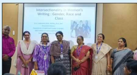
Faculty along with the chief guest at the celebration