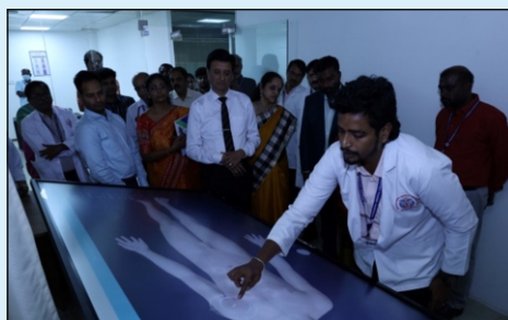
Inauguration of Virtual Anatomy Dissection System