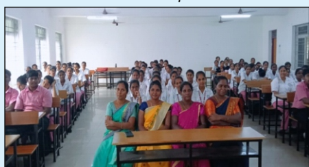
Audience at the event