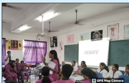
Students participating in debate

Across all campuses, the celebration of National Science Day successfully cultivated a spirit of inquiry and inspired students-ranging from schoolchildren to undergraduates-to explore, express, and contribute to the ever-evolving fields of science and healthcare.