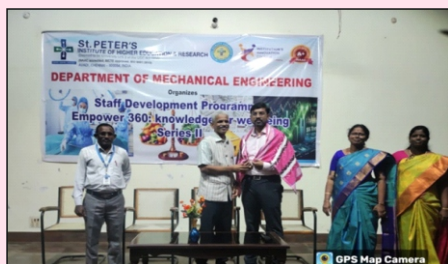
Felicitation of the Chief guest