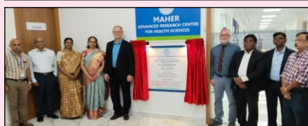
MAHER Centre for Global Health Research Inauguration