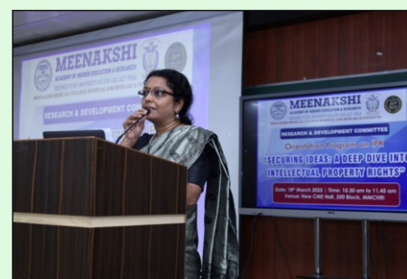
Inauguration of the IPR Orientation Programme