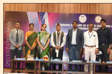
Inauguration of National Cyber Security Summit'25