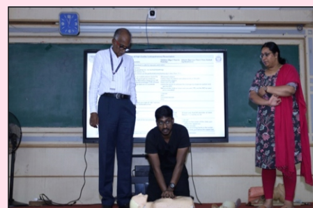
Hands-on being conducted