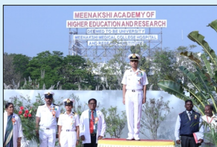
National Anthem observance