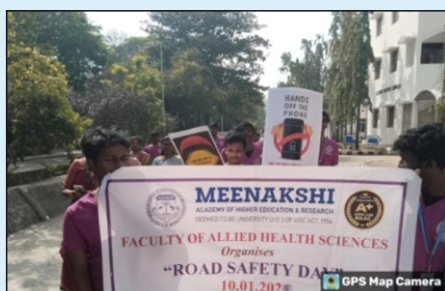
Students participating in the rally