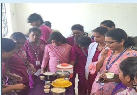
Students engaging in various competitions

Meenakshi Ammal Dental College celebrated International Women's Day on 7 th March, 2025, with great enthusiasm and energy. The event was organized by the Internal Complaint Committee in association with department of physical education and sports, MAHER and brought together teaching, non-teaching, and hospital attendants for a fun-filled day of activities and sports.