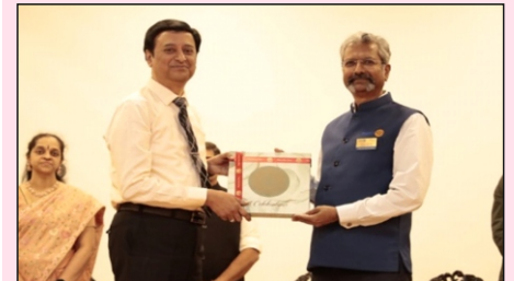
Felicitation of the guests