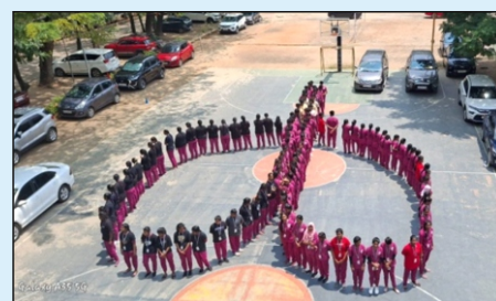
Symbolic lung-shaped human formation by the students

NSS Unit of the Faculty of Allied Health Sciences organized an Awareness Program in commemoration of World Tuberculosis Day for first-year AHS students on 24 th March, 2025, at the Maduravoyal campus, Chennai. The event commenced with a welcome address, followed by a guest lecture aimed at educating participants about tuberculosis.