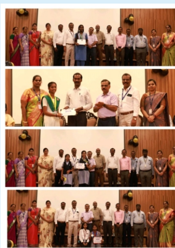
Prize winners with the organising team