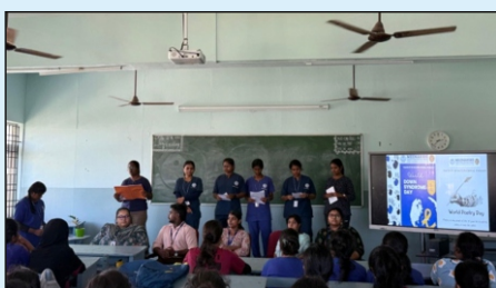
Students participating in World Poetry Day

NSS volunteers of the Faculty of Allied Health Sciences, MAHER, actively participated in the Massive Plastic Collection Drive organized by the Tamil Nadu Pollution Control Board at Pachaiyappa's Men's College, Kanchipuram, on 22 nd February, 2025, from 7:00 AM to 8:00 AM. A group of 20 dedicated students contributed to this meaningful environmental initiative, helping raise awareness about plastic pollution and promoting the importance of sustainability and responsible waste management.